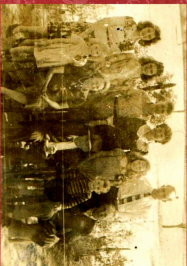
The Justice Family, early 1940s.