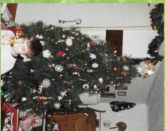
First Tree Cut at Justice Farms: 1989