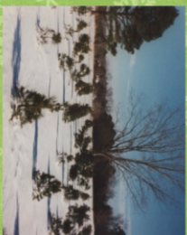
White Christmas ~ 1989