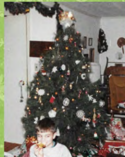
First Tree Cut at Justice Farms. 1989