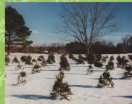
A White Christmas ~ 1989