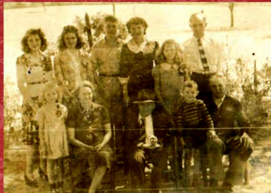
The Justice Family, early 1940s.